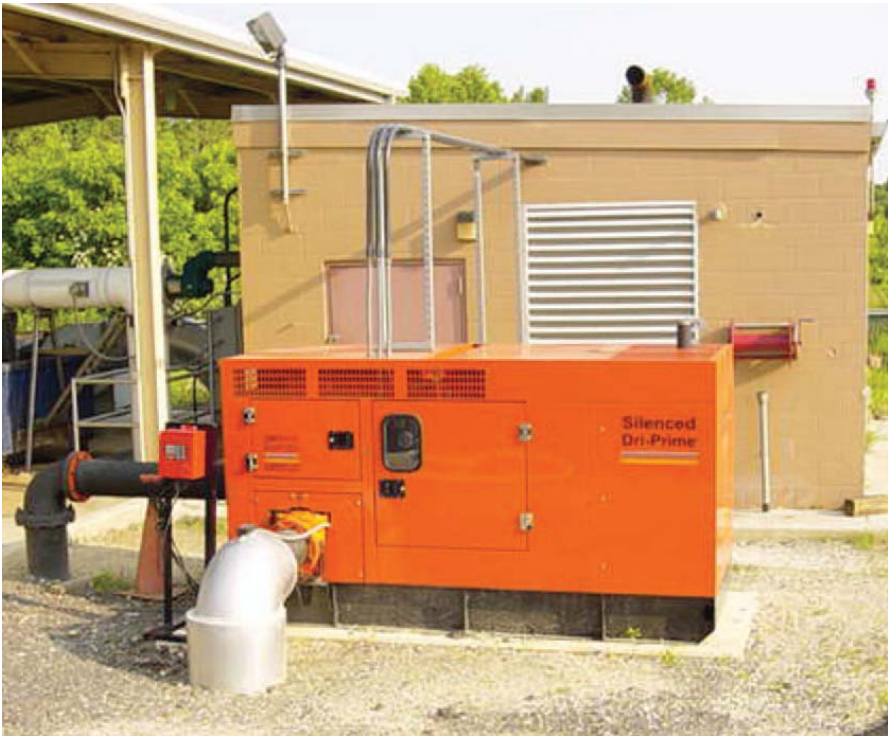
Godwin Critically Silenced Dri-Prime pump in Jessup, Maryland