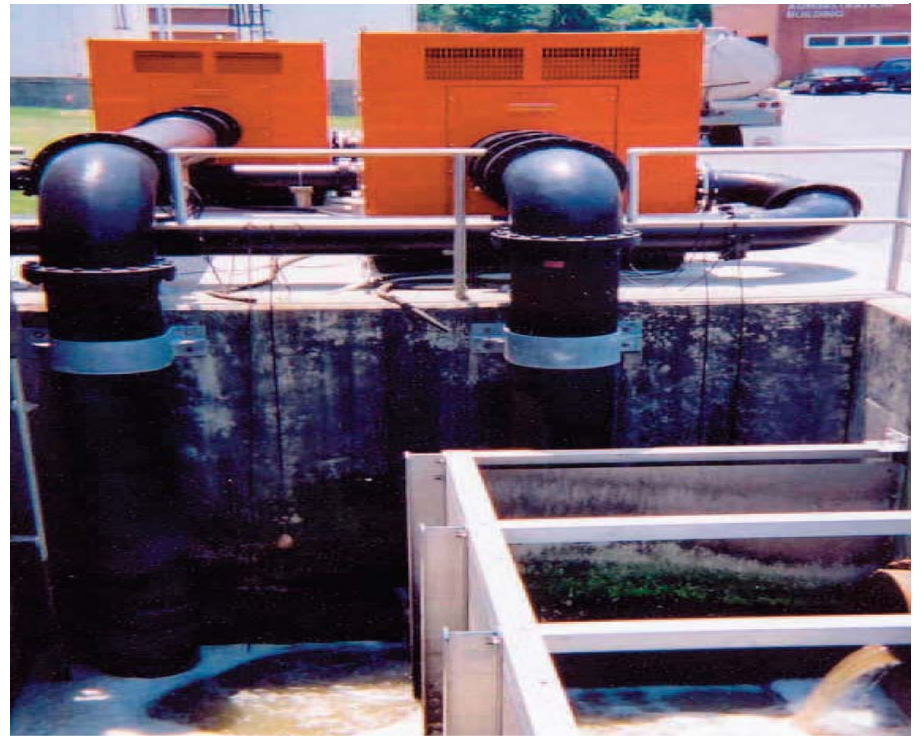
Two Godwin DPC300 Dri-Prime pumps at OWASA in North Carolina

Municipalities across the nation are concerned with maintaining lift station capabilities during system failures. The traditional design of lift station back-up systems incorporate diesel powered generators to provide electricity in the event of a power outage. To ensure critical pumping capabilities, these generators are being replaced by Automatic Dri-Prime Diesel Pumps so in the event of a pump failure, power outage, sewage clogging or other mishaps, the back-up pump system comes on and ultimately improves lift station reliability and flexibility.