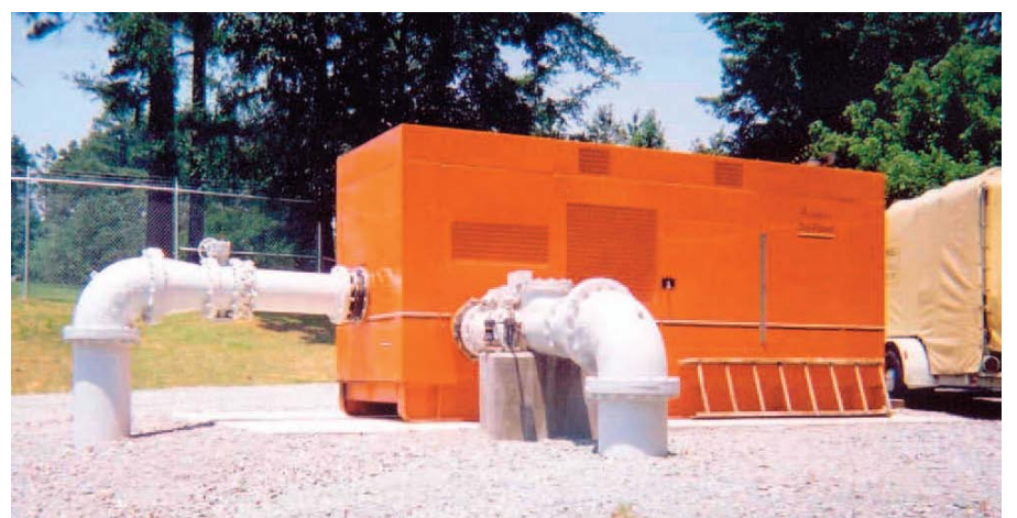
Godwin HL10M Dri-Prime pump at OWASA in North Carolina

Lift station back-up systems are already becoming a trend in the Hawaiian Islands for the military bases thanks to the help of Aqua Engineers (see picture on left).