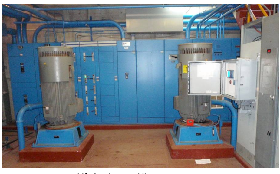
Lift Station at Aliamanu

An automatic lift station backup pump is a pump set-up on sonic transducers to automatically kick on if the lift stations go down. These units are critically silenced, continuously self priming, diesel driven pumps. The 12" x 10" HL250M CS Pump is capable of producing 5200 gpm and 380' of head! The 12" x 12" CD300M CS Pump is capable of producing 6000 gpm and 200' of head!