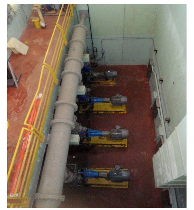
Lift Station at Fort Shafter

Aqua Engineers can be assured that their backup systems of Godwin Pumps are reliable.