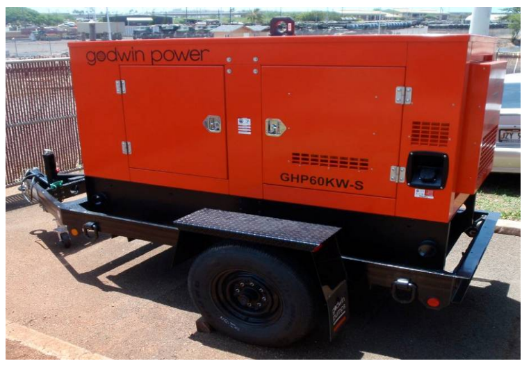
GHP 60kW-S Generator, Trailer Mounted

An automatic lift station backup pump is a pump set-up on sonic transducers to automatically kick on if the lift stations go down. These units are critically silenced, continuously self priming, diesel driven pumps. The 12" x 10" HL250M CS Pump is capable of producing 5200 gpm and 380' of head! The 12" x 12" CD300M CS Pump is capable of producing 6000 gpm and 200' of head!