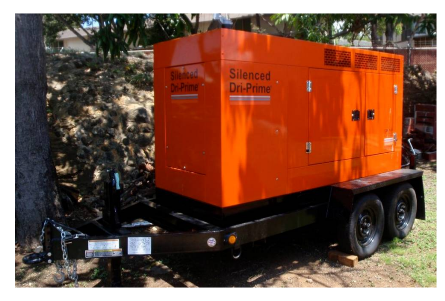
4" x 4" HL4M Critically Silenced Pump, Trailer Mounted