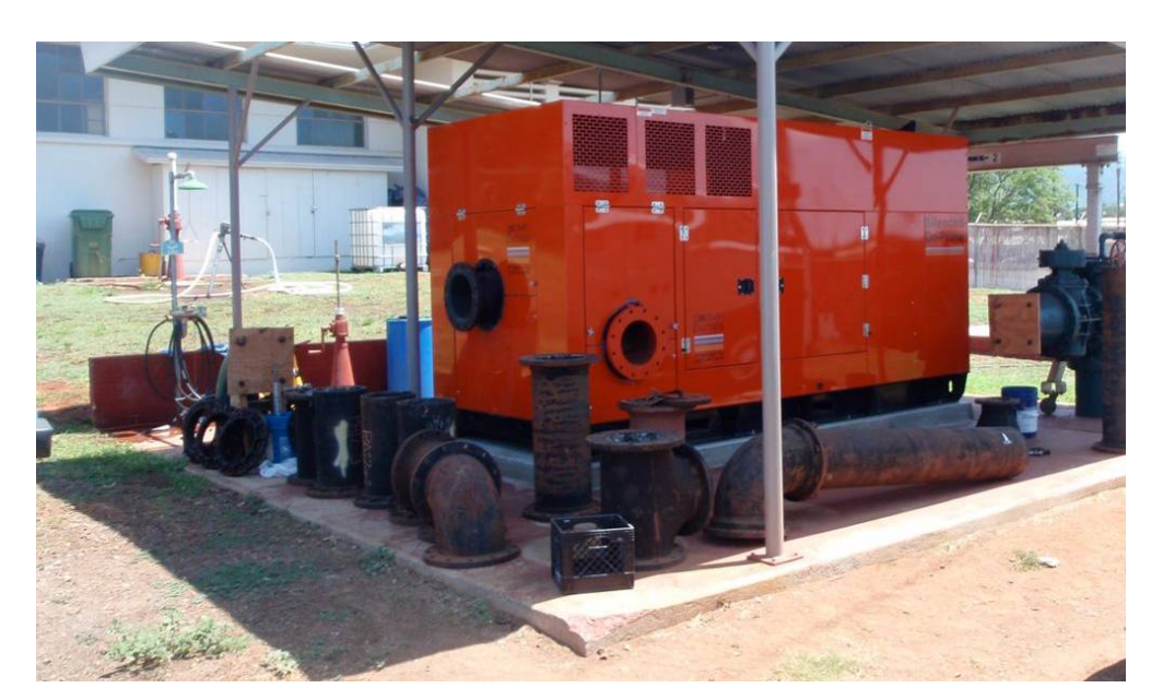
12" x 12" CD300M Critically Silenced Pump, Skid Mounted