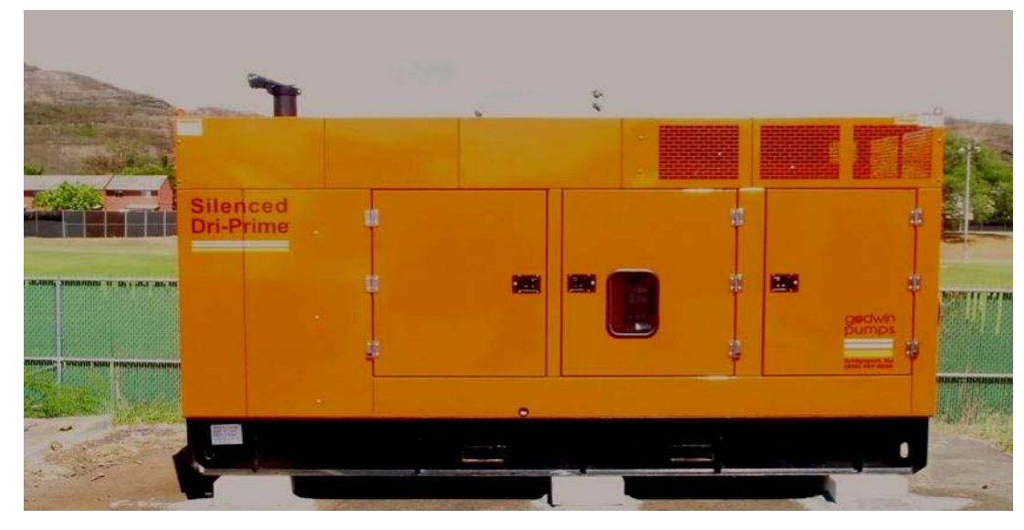
10" x 8" HL225M Critically Silenced High Head Pump, Skid Mounted