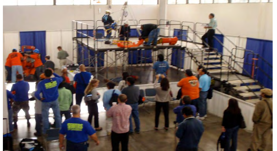
Our booth at the HWEA Conference 2009